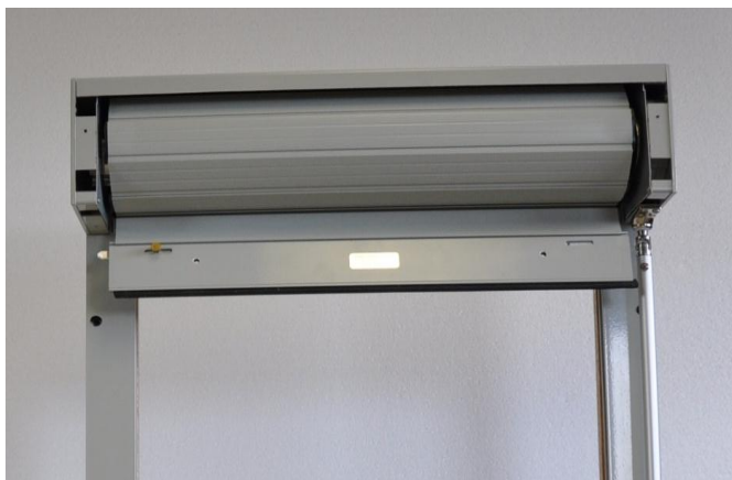
9. Remove dead bolts if installed and raise shutter completely. Drop shutter slat into rails.