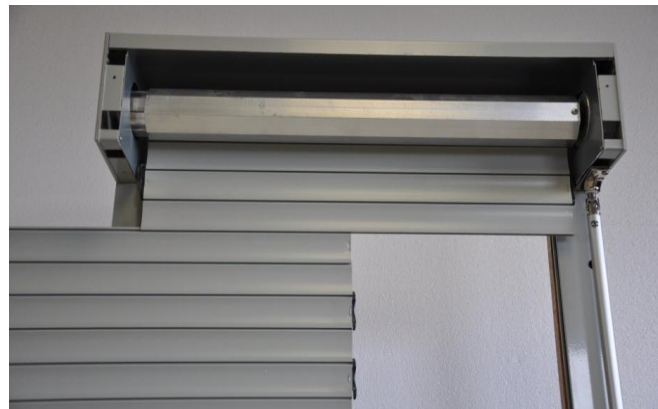
8. Unwrap slat from axle and hang outside of rails. Attach balance of slat bundle and raise shutter with crank.