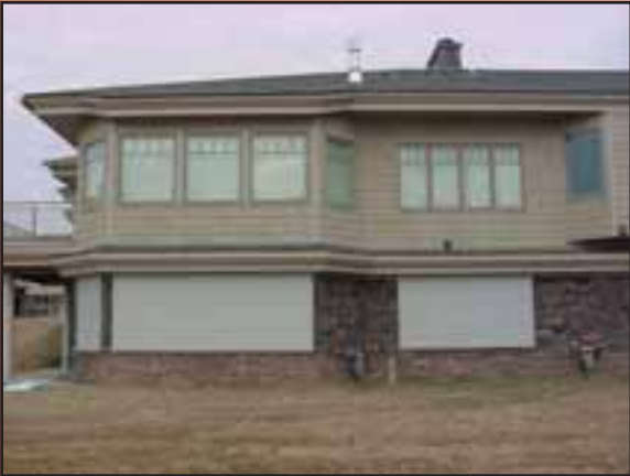
Bottom Shutter with Custom Storage