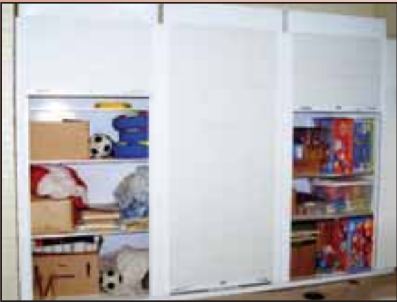
Covering Storage Shelves