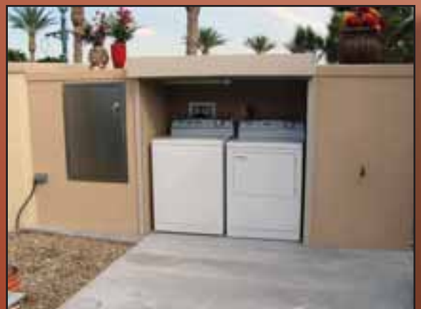
Outside Storage – Open