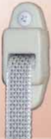
Strap Exit Guide

300 Industrial Road • Hillsboro, Kansas 67063 • 800-264-5171 • 620-947-2323 • Fax: 620-947-3053 • roger@rollupshutter.com • www.rollupshutter.com