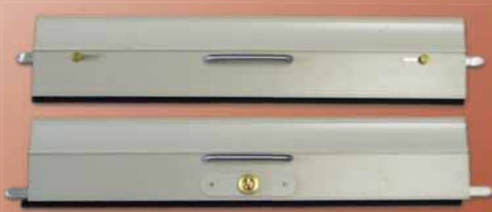
(Top) Slide Bolts