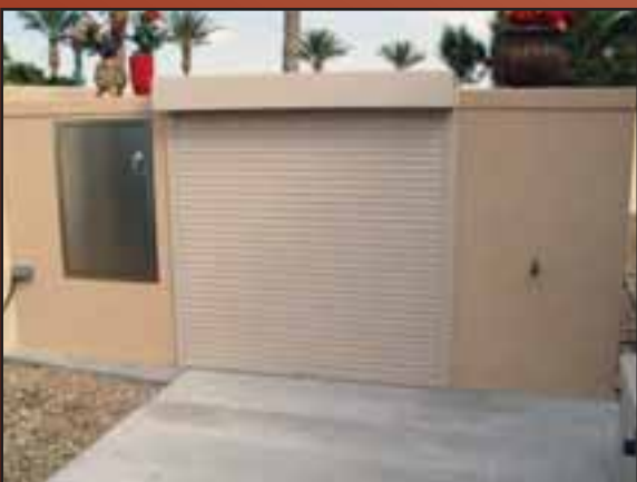
Outside Storage – Closed