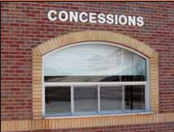
Shutter Behind Glass