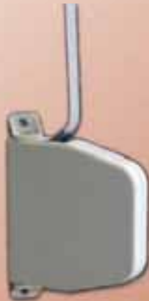
Strap Recoil Box