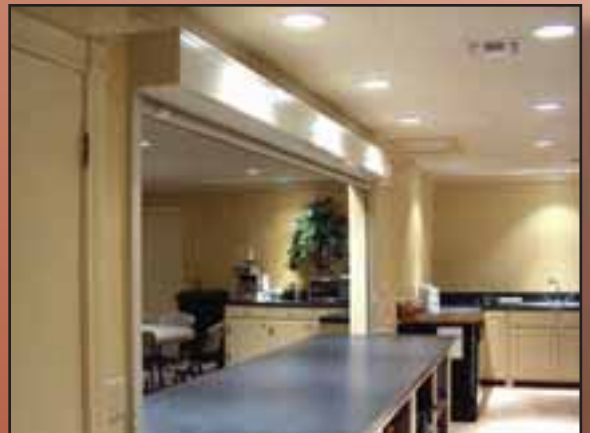
Serving Counter – Open