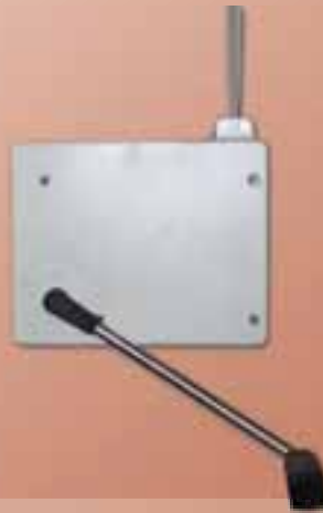
Strap Assist Crank