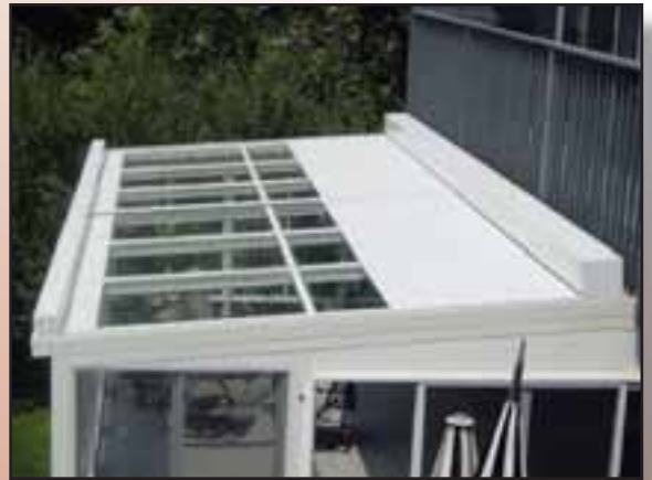
Push-Pull Shutter on Sunroom Roof