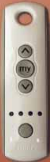
Remote Transmitter - 5 Channel