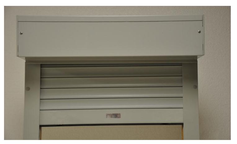
13. Attach face cover.