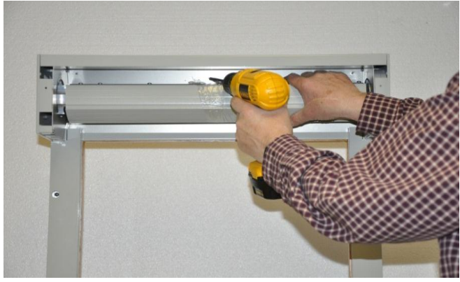
5. Set rails and storage box to the wall location. <u>Always support box until attached to wall or</u> the locator legs can break. They are not load bearing.