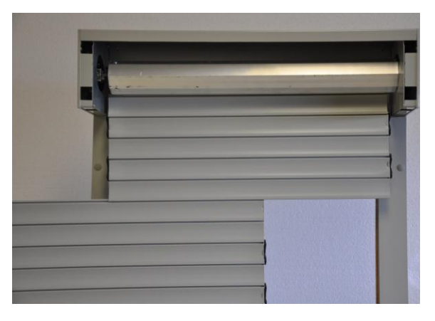
8. Unwrap slat from axle and hang outside of rails. Attach balance of slat bundle and raise shutter.

From coil side of shutter the bottom is for top limit and upper one is bottom limit of shutter. If motor is coil left, the yellow is at the bottom If motor is coil right, the white is at the bottom.