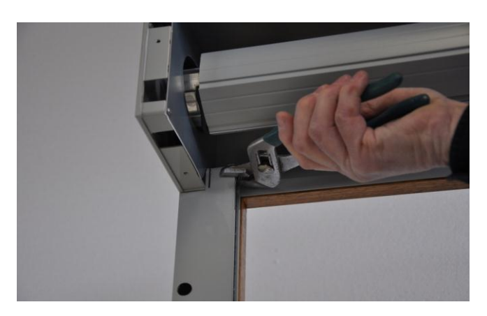
12. Form front rail guide. Use channel lock pliers to bend front ear of rail forward 30 degrees. This forms a guide for the slat to enter the rails.