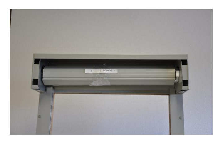
7. Attach motor wire to switch and connect to power. For installion, a short cord with plug can be used. One wire to connected to the white of the motor and the other touched to the black or red for up or down control.