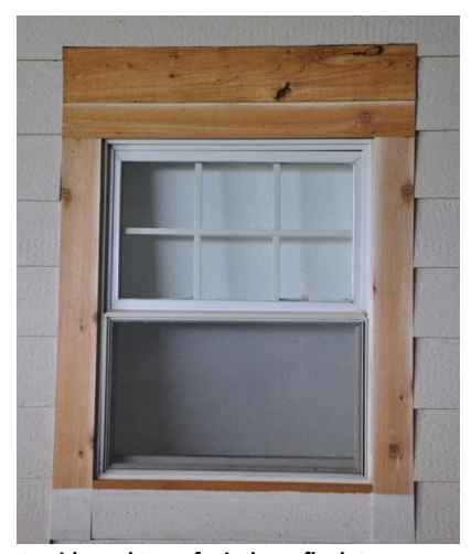
1. Add trim to side and top of windows flush to outer surface of window frame and any other extention. Shutter needs to be mounted on a flat surface.