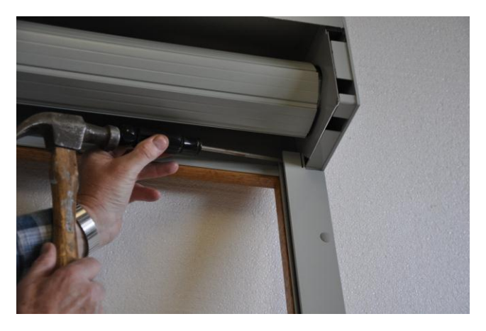
11. Form side of rail by pushing top sideways 1/8"