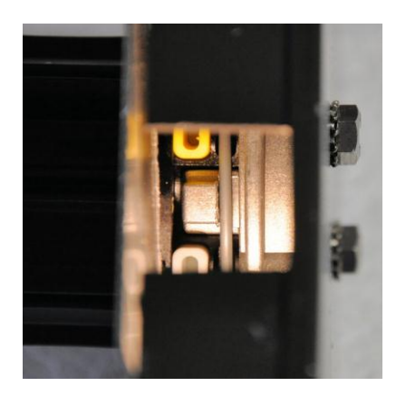
View of motor limit buttons through end cap hole.

10. When buttons are in the (in) position the motor will not stop. Put shutter down and release top button. Put shutter up and release bottom button.