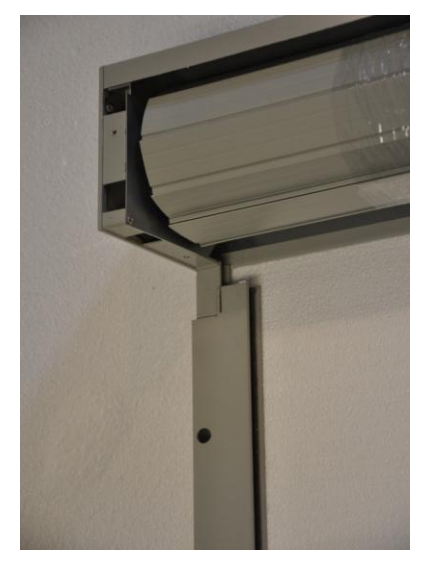
3. Slip rails onto end cap locator legs.