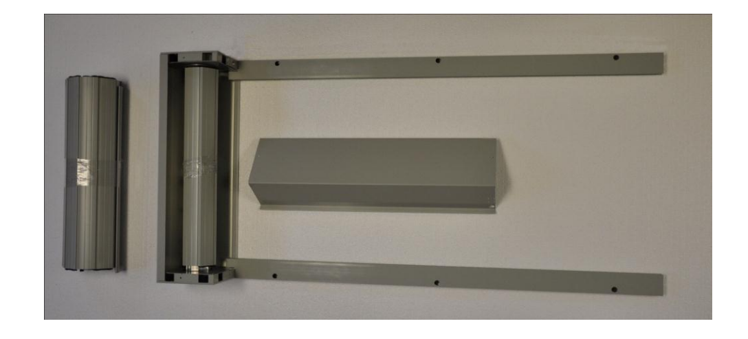
Parts of the shutter with face cover removed. Screws and other small parts are provided.