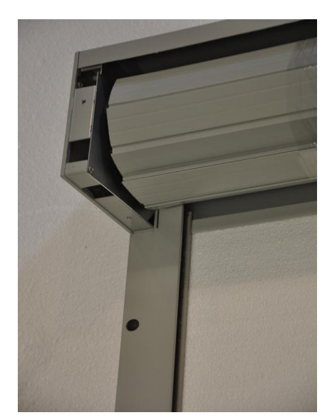
4. Rail totally on locator leg.