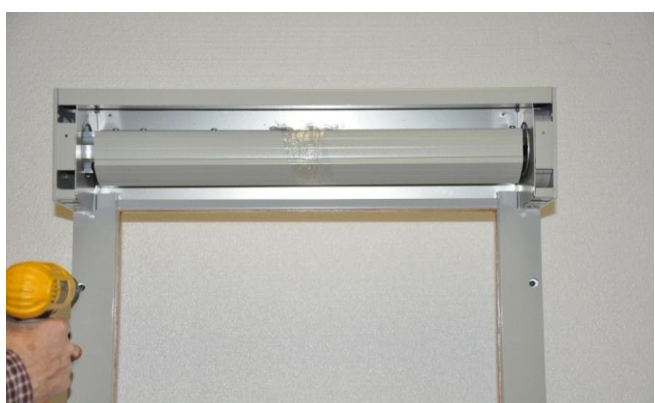
6. Attach the rails to the wall.