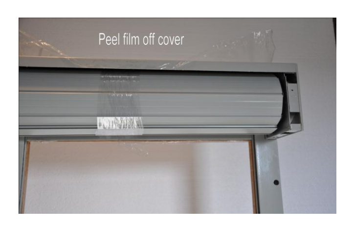
2. Remove protective film from box covers.