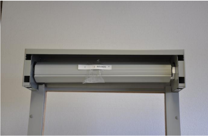
7. Spin axle in direction of shutter going down ( ) turns. Number of turns depends on shutter height. Check information on shutter roll. Turning the wrong way will cause torsion spring to detach.