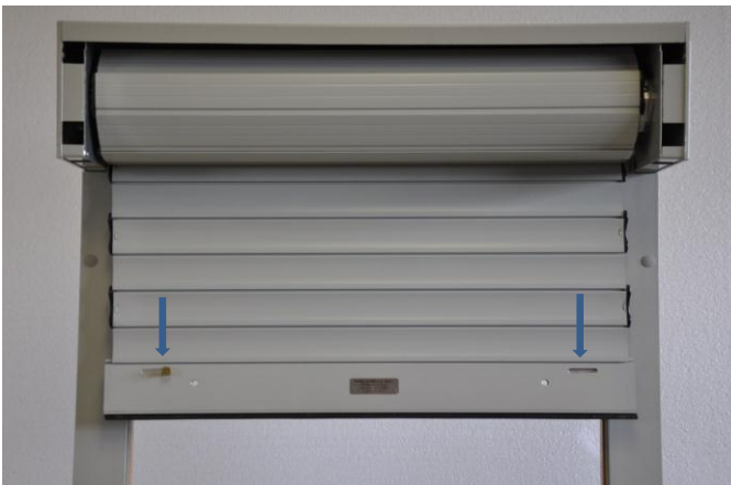
9. Remove dead bolts if installed and raise shutter completely. Lower slat into rails.