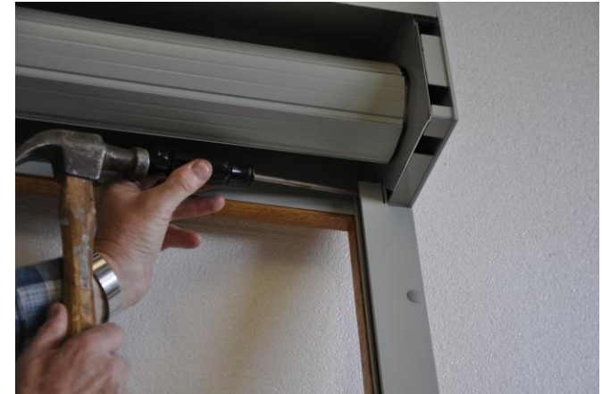
10. Form side of rail by pushing top sideways 1/8"