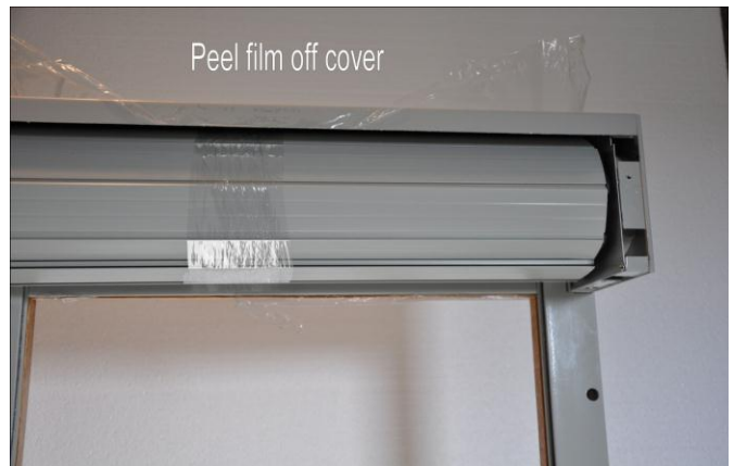
2. Remove protective film from box covers.