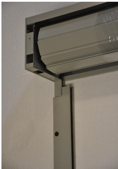
3. Slip rails onto end cap locator legs.