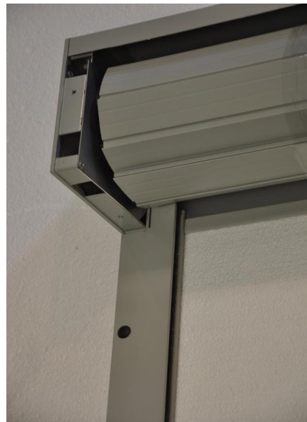
4. Rail totally on locator leg.