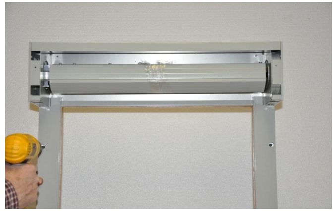
6. Attach the rails to the wall.