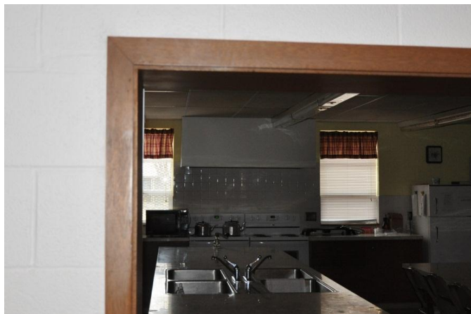
1 Remove casing from jamb if present. Shutter needs to be mounted on a flat surface.