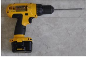
Power driver with 6" Phillips #2 tip is best tool to install the shutter.