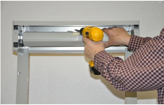
5. Set rails and storage box to the wall location. Always support box until attached to wall or the locator legs can break. They are not load bearing.