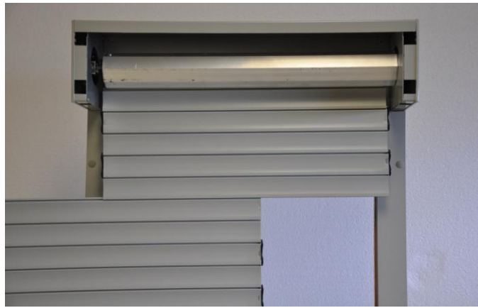
8. Unwrap slat from axle and hang outside of rails. Attach balance of slat bundle and raise shutter.