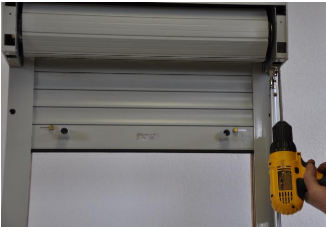
13. Remove crank handle so cover can be installed.