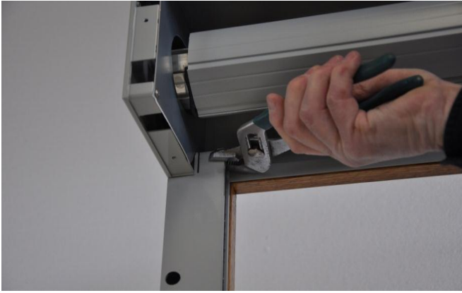
11. Form front rail guide. Use channel lock pliers to bend front ear of rail forward 30 degrees. This forms guide for slat to flow into rail.