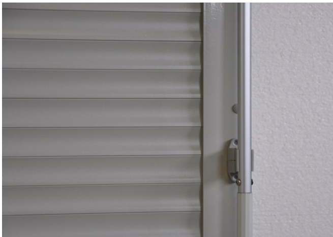
15. Attached crank handle clip to edge of rail.