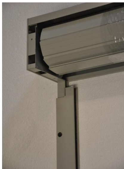
3. Slip rails onto end cap locator legs.