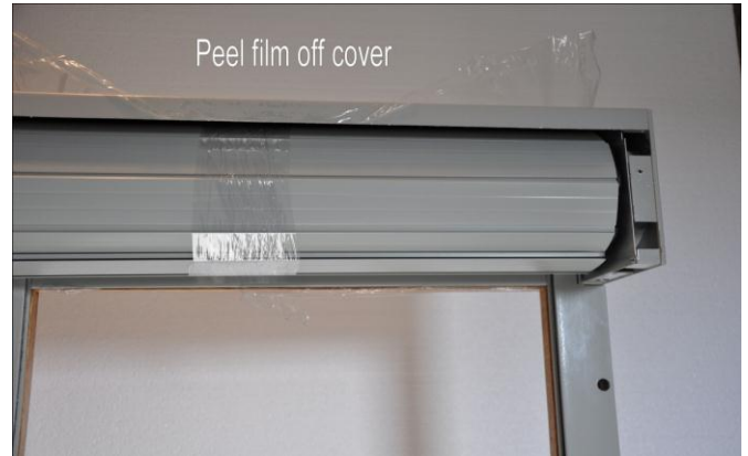
2. Remove protective film from box covers.