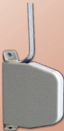
Strap Recoil Box