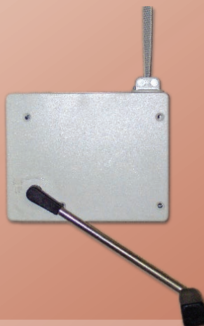
Strap Assist Crank