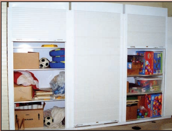
Covering Storage Shelves