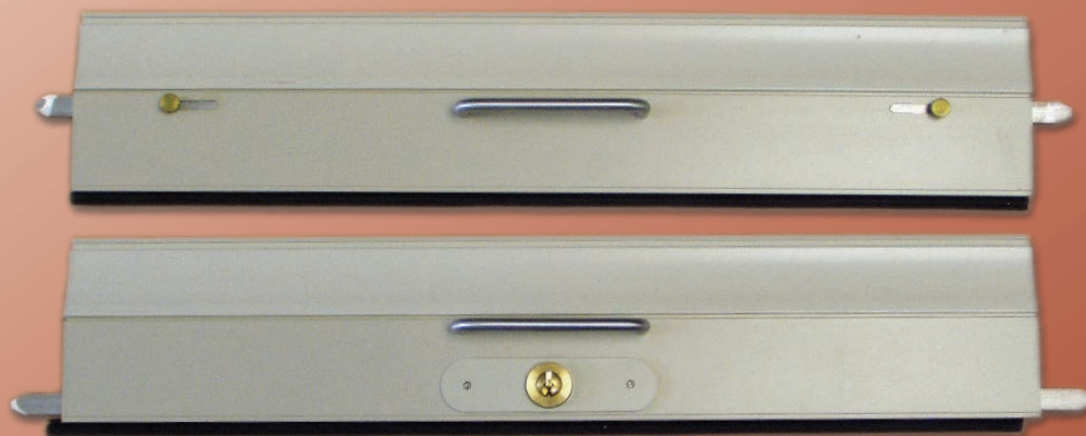
(Top) Slide Bolts