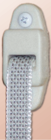
Strap Exit Guide

300 Industrial Road • Hillsboro, Kansas 67063 • 800-264-5171 • 620-947-2323 • Fax: 620-947-3053 • roger@rollupshutter.com • www.rollupshutter.com