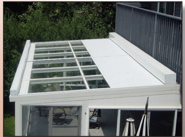
Push-Pull Shutter on Sunroom Roof