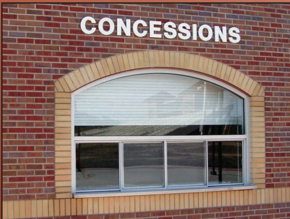
Shutter Behind Glass