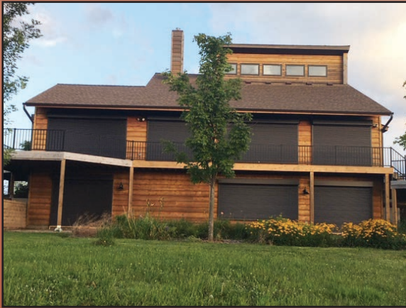
Residence Windows & Decks