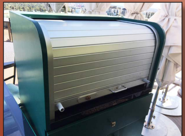
Outside Storage – Curved Track